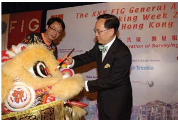
The Honorable Donald Tsang, GBM, "dotting the eyes of the lions."