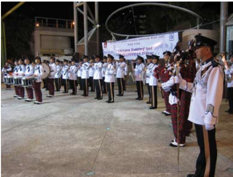
Hong Kong Police Band and Pipes entertaining delegates before dinner